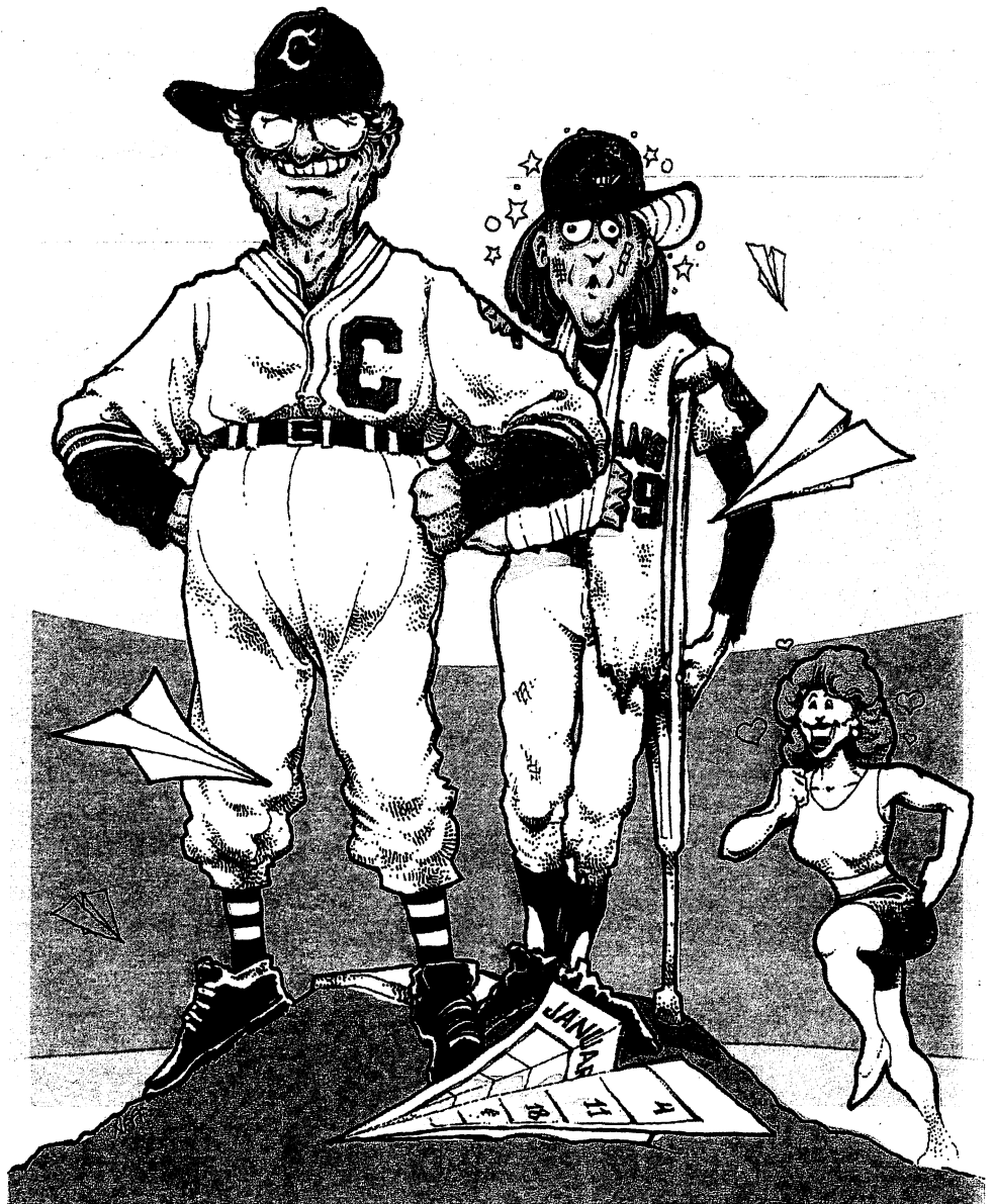
ILLUSTRATION BY WILLIAM NEFF